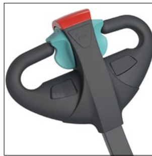
Ergonomic tiller head