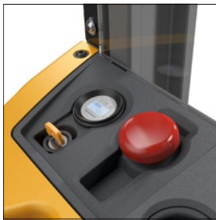
Centralized control instruments