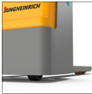
High level of safety due to low ground clearance