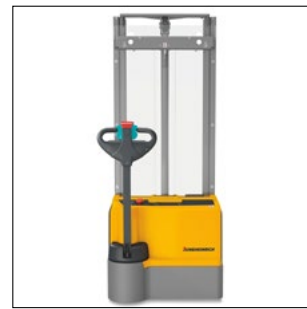
Optimized visibility through mast